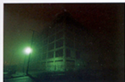
Fog Ship, Fisher Body from Ziggurat and FB21, 2007-2009