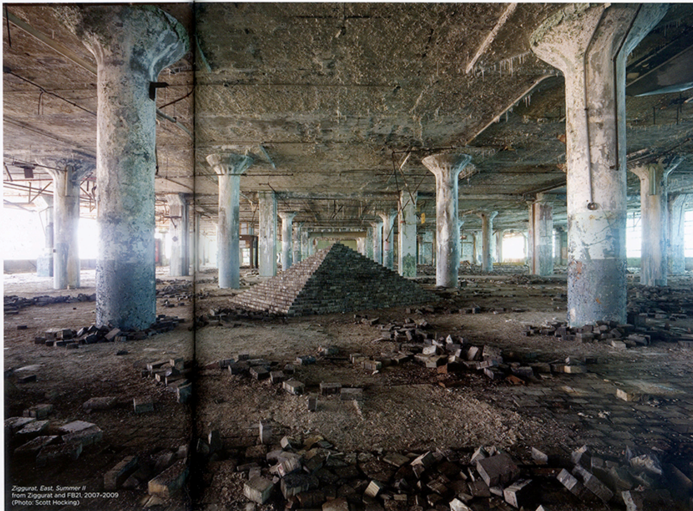
Ziggurat, East, Summer II from Ziggurat and FB21, 2007-2009