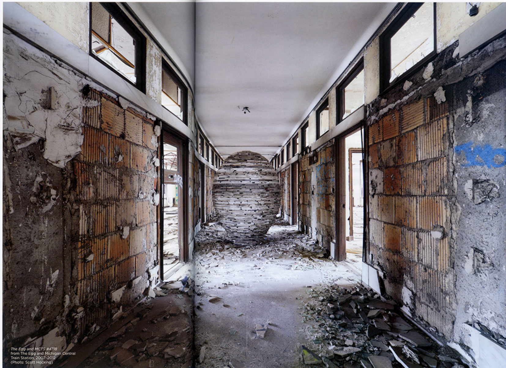
The Egg and MCTS #4718 from The Egg and Michigan Central Train Station, 2007-2012