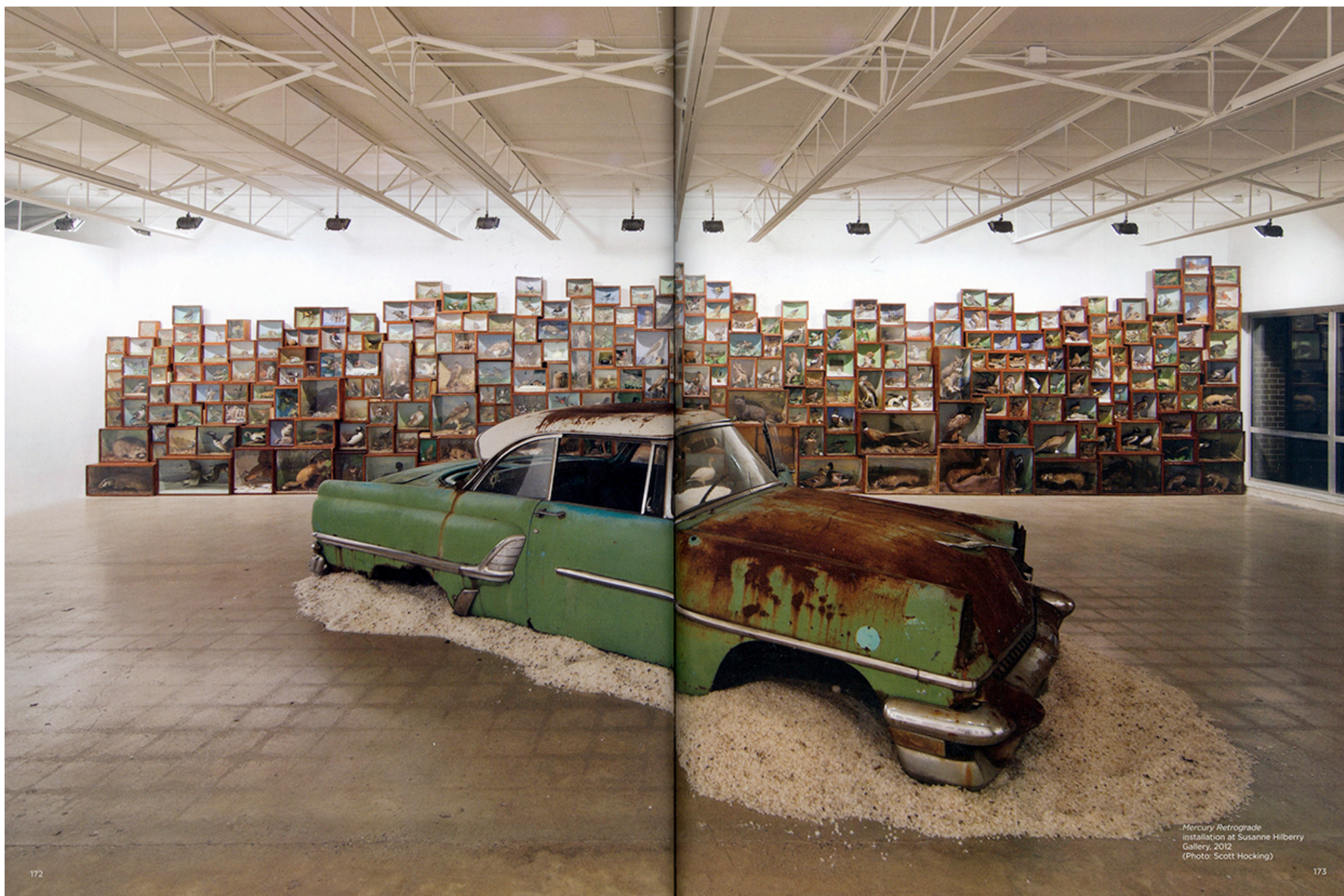
Mercury Retrograde installation at Susanne Hilberry Gallery, 2012