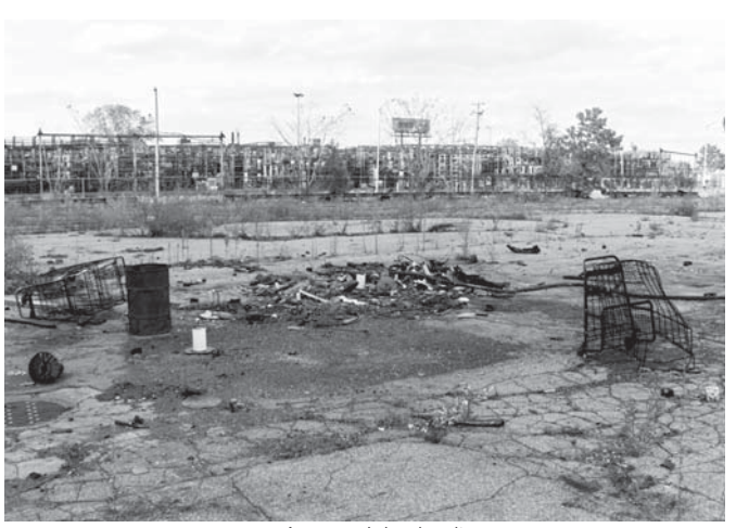
A scrapper's burning site