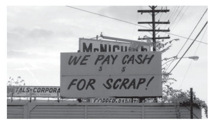
The sign "We pay cash for scrap!" attracts many scrappers. They know that they can make quick money without being hassled or having to answer any questions.

Attempts are made to stop the scrappers from scrapping from the scrap-yards. Often cameras or armed guards are employed to protect businesses from greedy scrappers. In most cases, it is not the solitary homeless scavenger who would risk a breaking and entering charge; rather, it is organized groups with vehicles for quick getaways. Nevertheless, scrappers are nocturnal opportunists, and no painted wall alone will stop them.