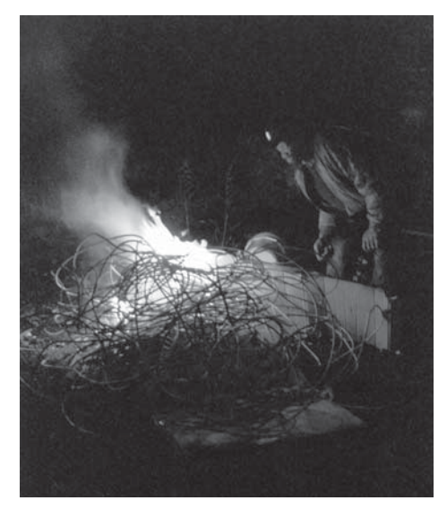
Scrapper "Country" burning the plastic coating off of copper cable.

to be found in any long abandoned buildings. Aluminum siding is far more plentiful, but it is worth roughly $0.45 per pound and weighs considerably less. Other metals such as nickel and brass are welcome, but hard to find, whereas inexpensive and extremely heavy cast iron is generally a last resort.