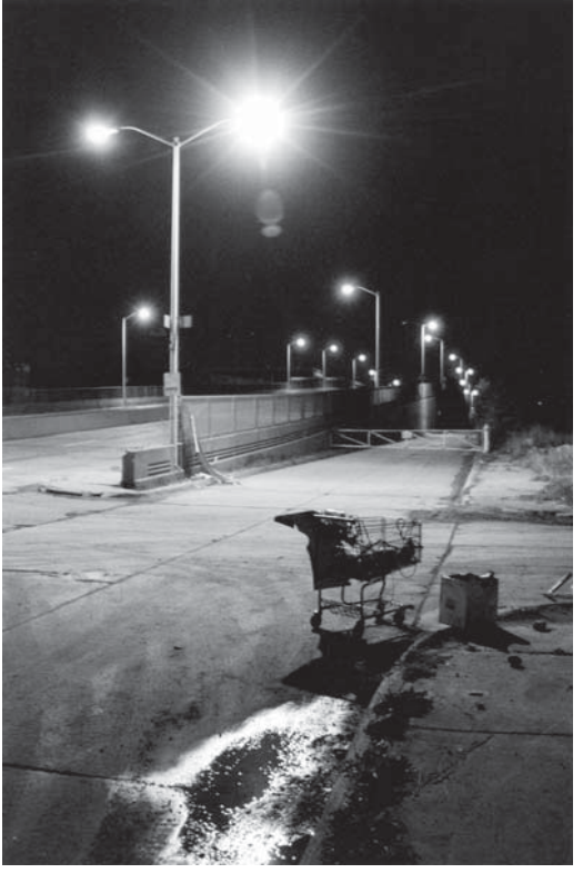
Country's cart at night