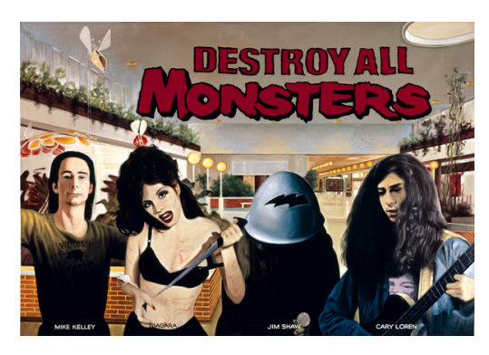
"Mall Culture," part of a larger installation by a group of artists that included Mike Kelley, far left.