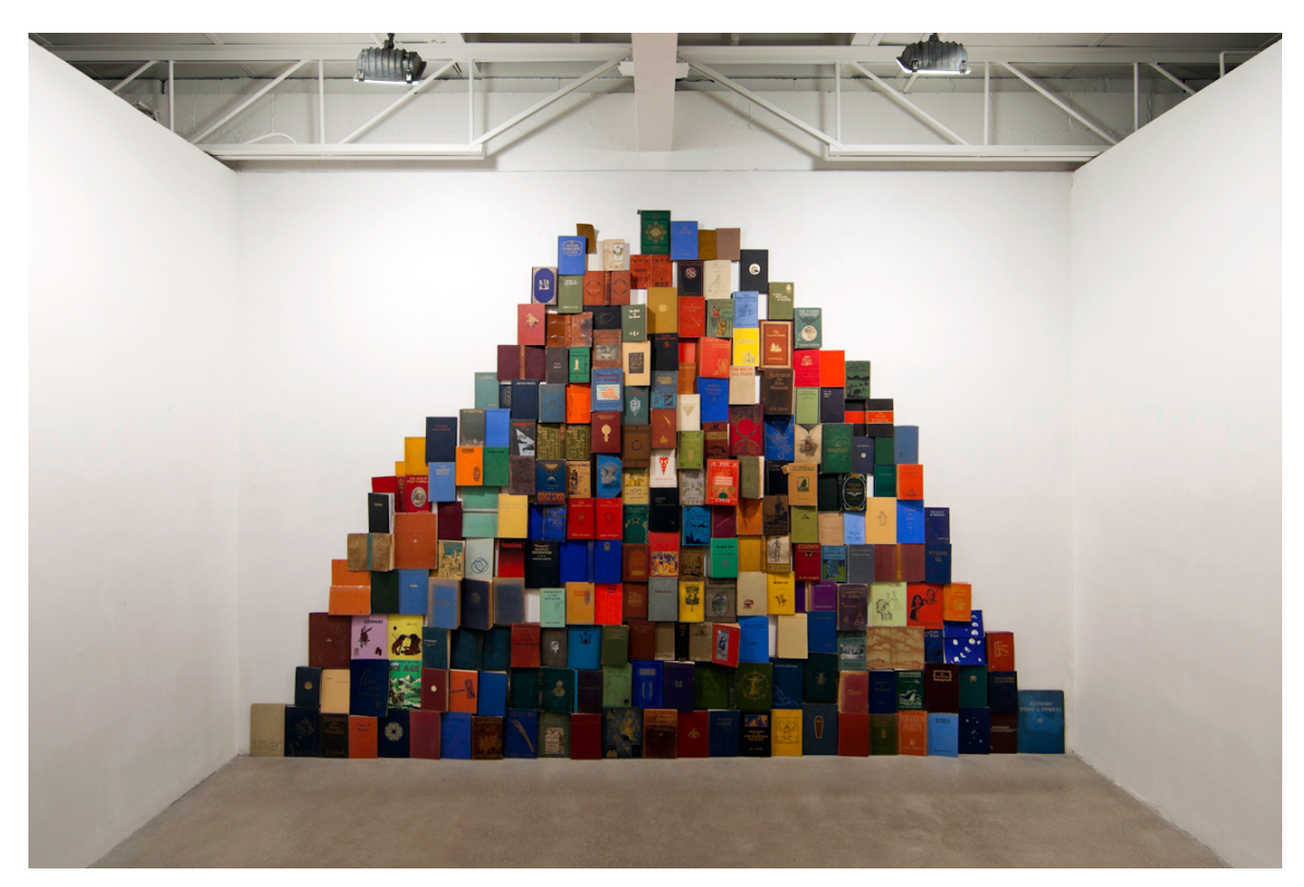
The End of the World, 2012

LM: There is another aspect of The Night of the Hunter I wanted to discuss—the fanaticism. The killer's fanatic beliefs are a driving force for much of the story. This tradition of storytelling can be the impetus and the drive for so many real life actions, good and evil. In your own work you take up such topics, like your project The End of The World (2012), which is a stacked collection of over 200 books about the apocalypse and destruction mythologies. And also there is your recent epic installation, The Celestial Ship of the North (2015), in which you painstakingly inverted an old barn into an ark. I have this idea that you find productive creative value in the fanatic heart and mind.